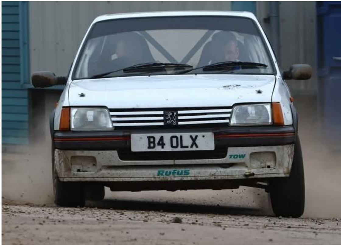
Winners Berwick Classic Rally 2025 : Ali Proctor / Phil Savage